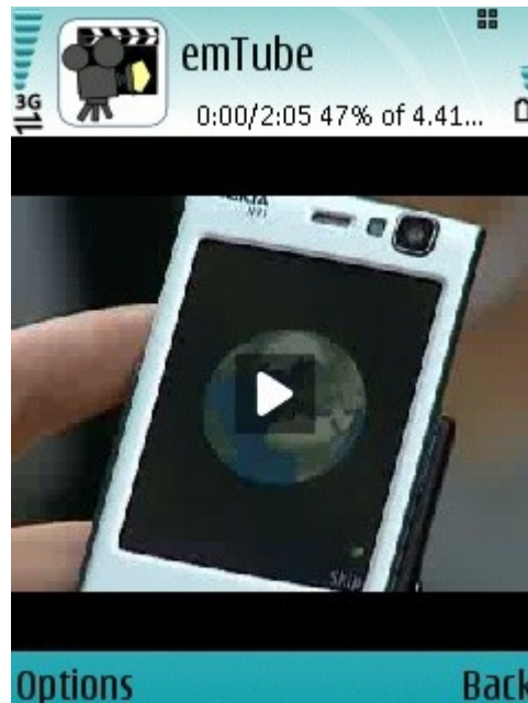
The video is ready to play. The download will continue in the background during the playback.

The navigation pane displays information about a video such as the current time and video duration, as well as a video's size (in MB) and how much of the video has been downloaded. The last information is only presented when a remote video is being played. Once the video is ready, you can start the playback either via menu (" Play ") or by using the center joystick button. Other keys: